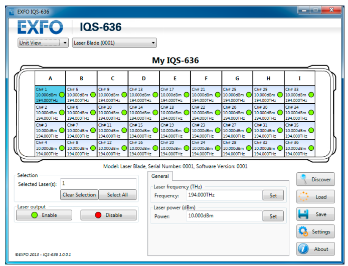
Figure 1. Unit view

Users can control each laser individually, or control multiple lasers to create tilt over a wavelength range and automatically spread the lasers over the entire C band for example.