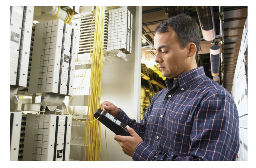
EXFO's LFD-250B provides fail-safe traffic detection and induces guaranteed low loss for all fibers and at all wavelengths.