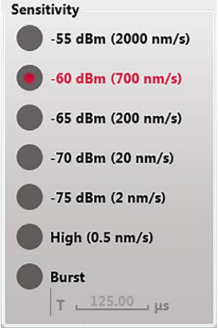
Figure 1. Sweep speed

The burst sensitivity is adapted to burst signals and dedicated to GPON measurements. The duty cycle must be in the range 2-100 % with a period between 124 and 2001 \mu s.