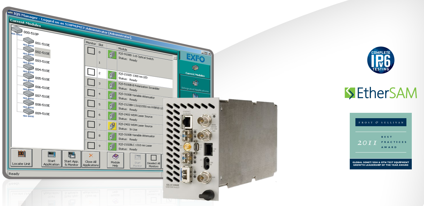
Please note that this model has been discontinued. For more information, visit EXFO.com

NEXT-GENERATION MULTISERVICE TEST MODULES